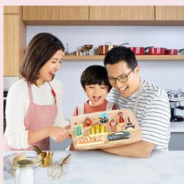
Global Power Multi-Currency Plan 3

Apply successfully for a Specified Insurance Plan during the promotional period to enjoy up to 65.7% of the first year's annual premium!