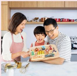
Global Power Multi-Currency Plan 3

Apply successfully for a Specified Insurance Plan during the promotional period to enjoy up to 83.8% of the first year's annual premium!