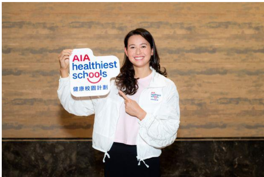
Siobhan Haughey promoting AIA Healthiest Schools Programme

AIA Group Limited is incorporated in Hong Kong with limited liability. “AIA Hong Kong & Macau”, “AIA Hong Kong”, “AIA Macau” or “the Company” herein refers to the Hong Kong Branch and/or Macau Branch of AIA International Limited (Incorporated in Bermuda with limited liability). “Hong Kong” and “Macau” herein refer to “Hong Kong Special Administrative Region” and “Macao Special Administrative Region”, respectively.