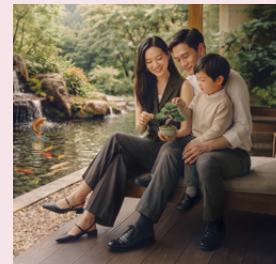
Wealth Flexi Savings Insurance Plan