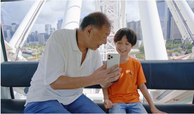
Caption: Hong Kong Observation Wheel AR App is something the whole family can enjoy