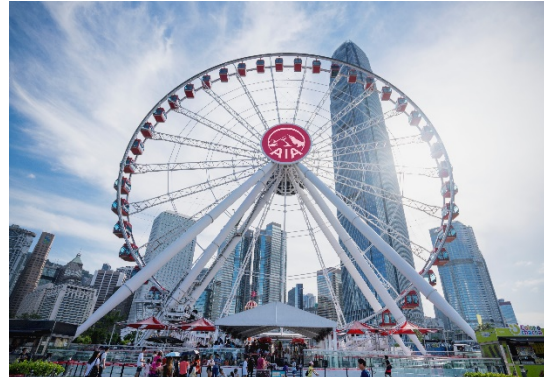
Caption: Hong Kong Observation Wheel welcomes people to take in the views of the city from their private gondola