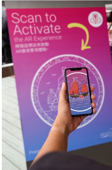
Caption: Visitors can scan the QR code at the waiting area to begin the AR App experience