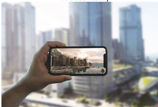
Caption: In the City in Transition mode of the AR App, images of Hong Kong in the 1960-1980's overlay what is seen today