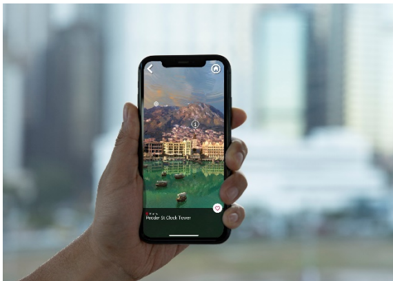
Caption: In the Beyond the Beginning mode of the AR App, images of Hong Kong in the 1890-1920's will overlay what is seen today