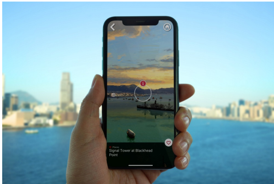
Caption: The Hong Kong Observation Wheel AR App gives visitors the opportunity to see Hong Kong from three perspectives: Beyond the Beginning (1890-1920); City in Transition (1960-1980); and Present Day.

(HONG KONG – 19 NOVEMBER 2020) - The iconic Hong Kong Observation Wheel and AIA Vitality Park have launched the Hong Kong Observation Wheel AR App , which elevates the visitor experience through never-before-seen Augmented Reality (AR) technology. Through visual immersions of Hong Kong in the 1890s and 1960s, the App encourages visitors to unlock the beauty of the harbour and learn about the city's development. Officially launched today, the free mobile application now available on IOS and Android, in English, Traditional Chinese and Simplified Chinese.