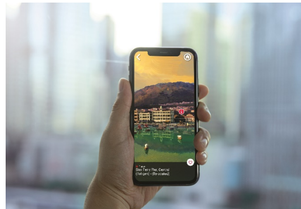
Caption: In the Beyond the Beginning mode of the AR App, visitors will see what the first generation Star Ferry Pier looked like